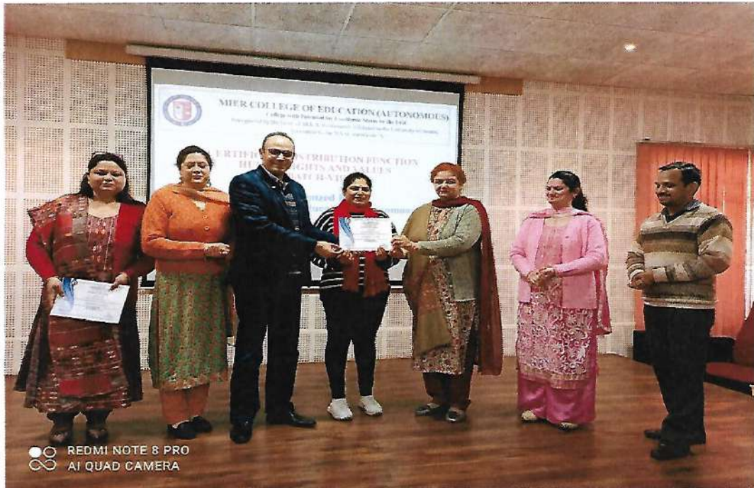
Student receiving the certificate