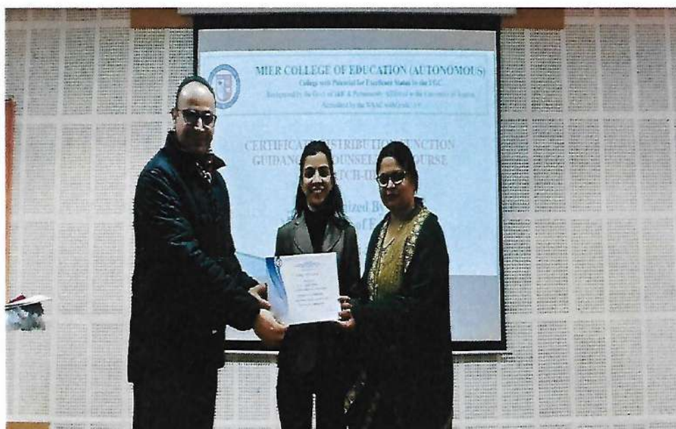
Student receiving the certificate