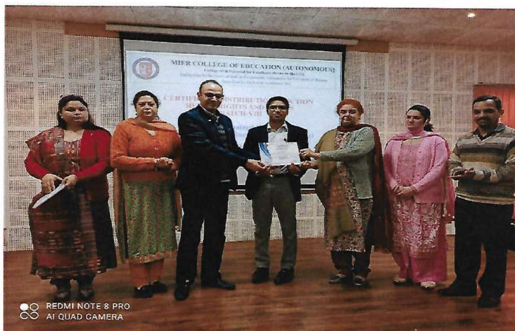
MIER Student receiving the certificate