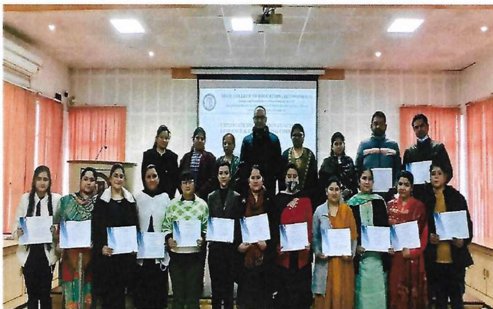
Group photograph of the students with the Principal and the HOD