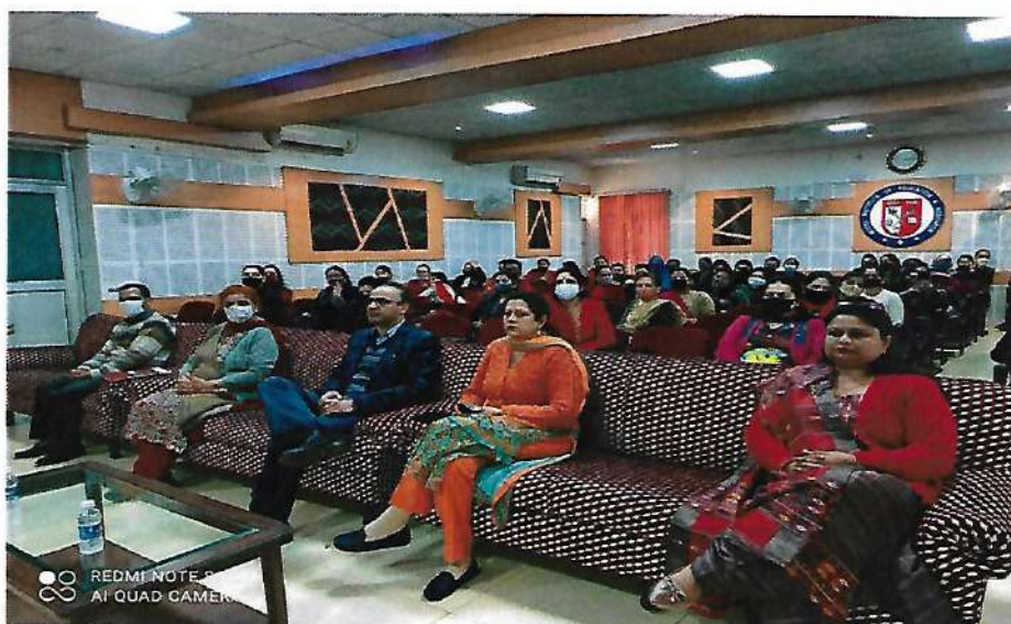
Students and the guests attending the ceremony