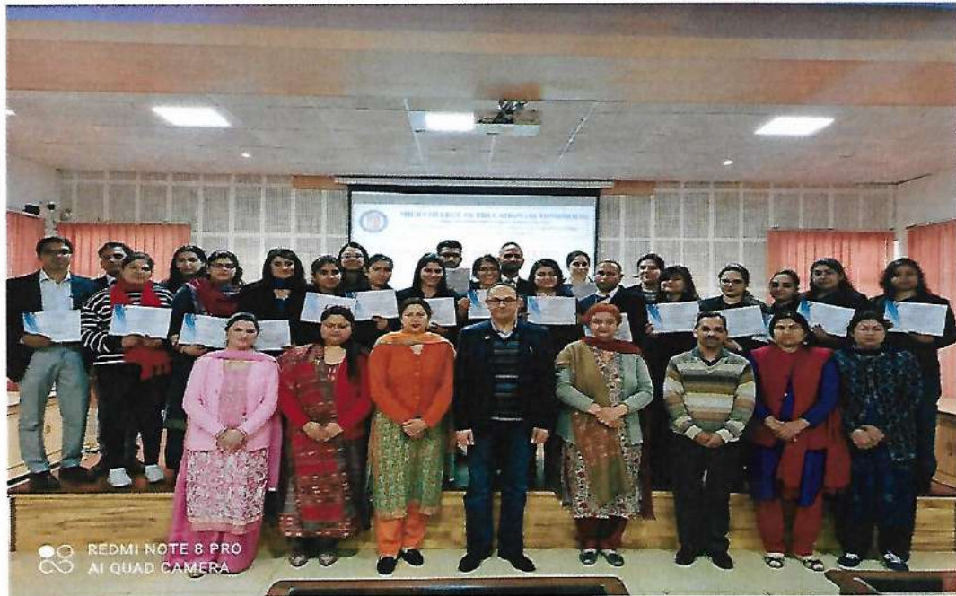
Group photograph of the students with the distinguished guests