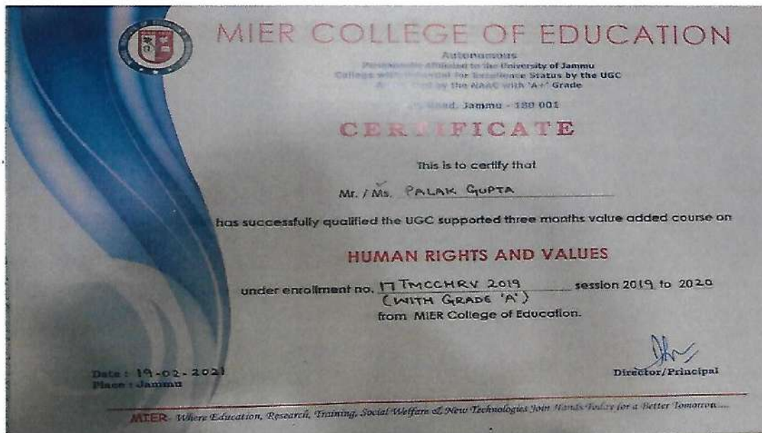
Certificate of Palak Gupta