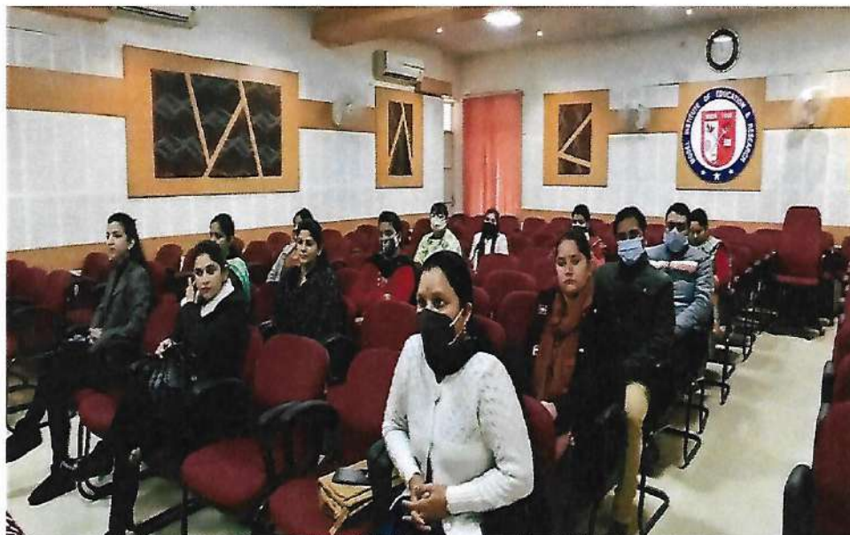
Students attending the ceremony